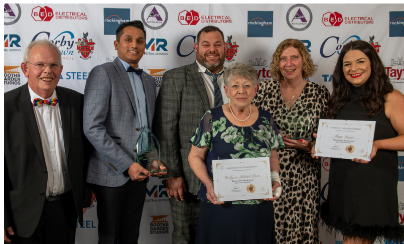
Corby & District Lions and Shape Dance were honoured with special awards for their service to the community